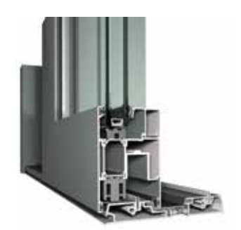
CP 155-LS/HI low treshold