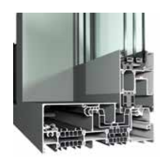
CP 155-LS/HI with Minergie label